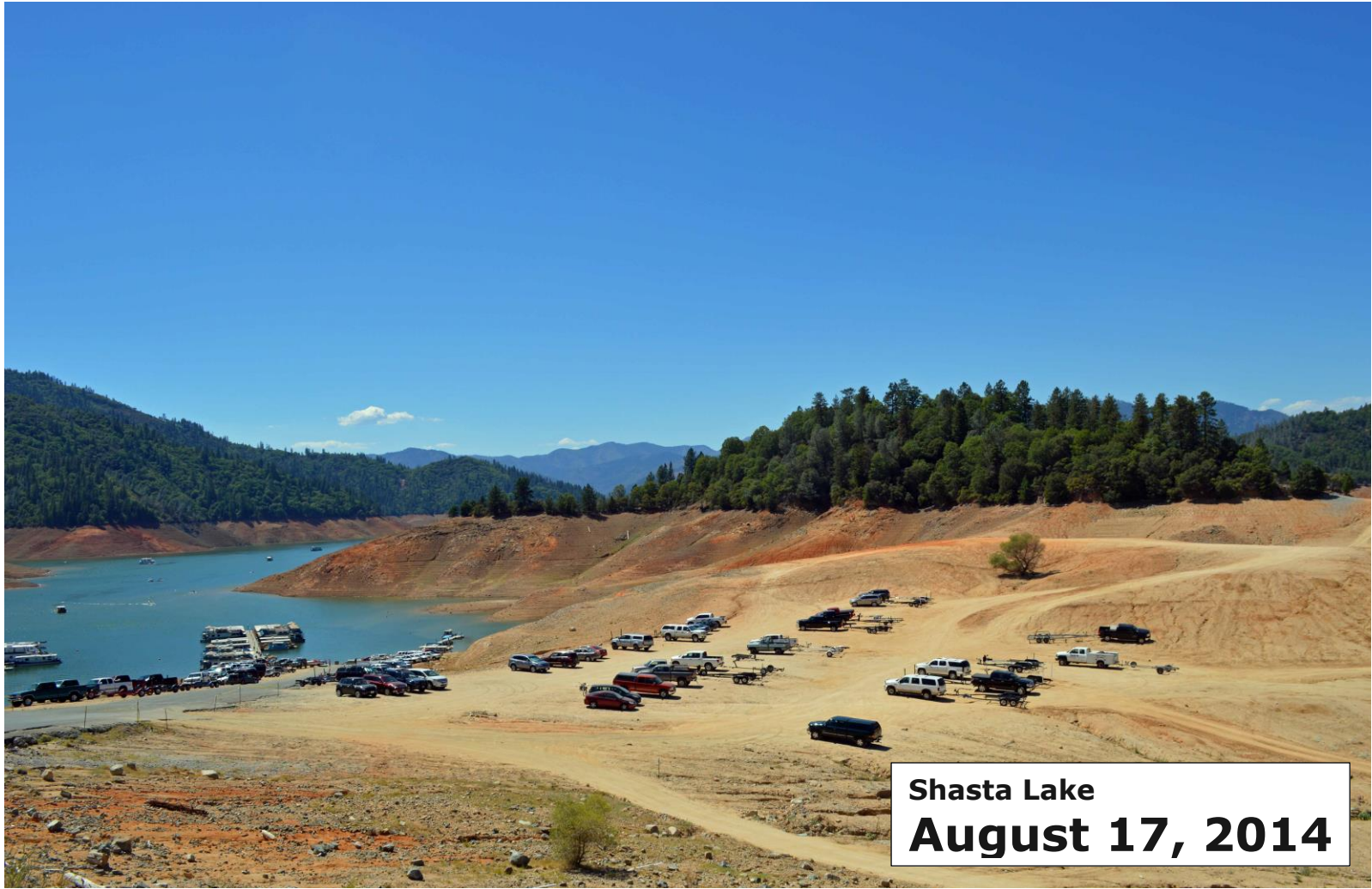
Shasta Lake August 17, 2014