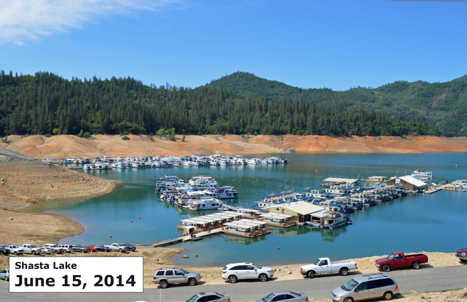
Shasta Lake June 15, 2014