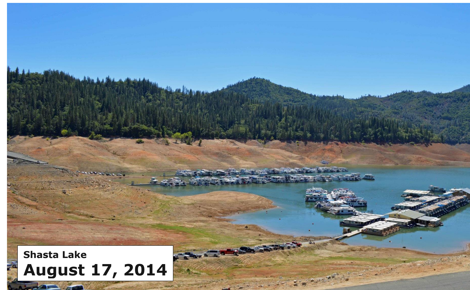
Shasta Lake August 17, 2014