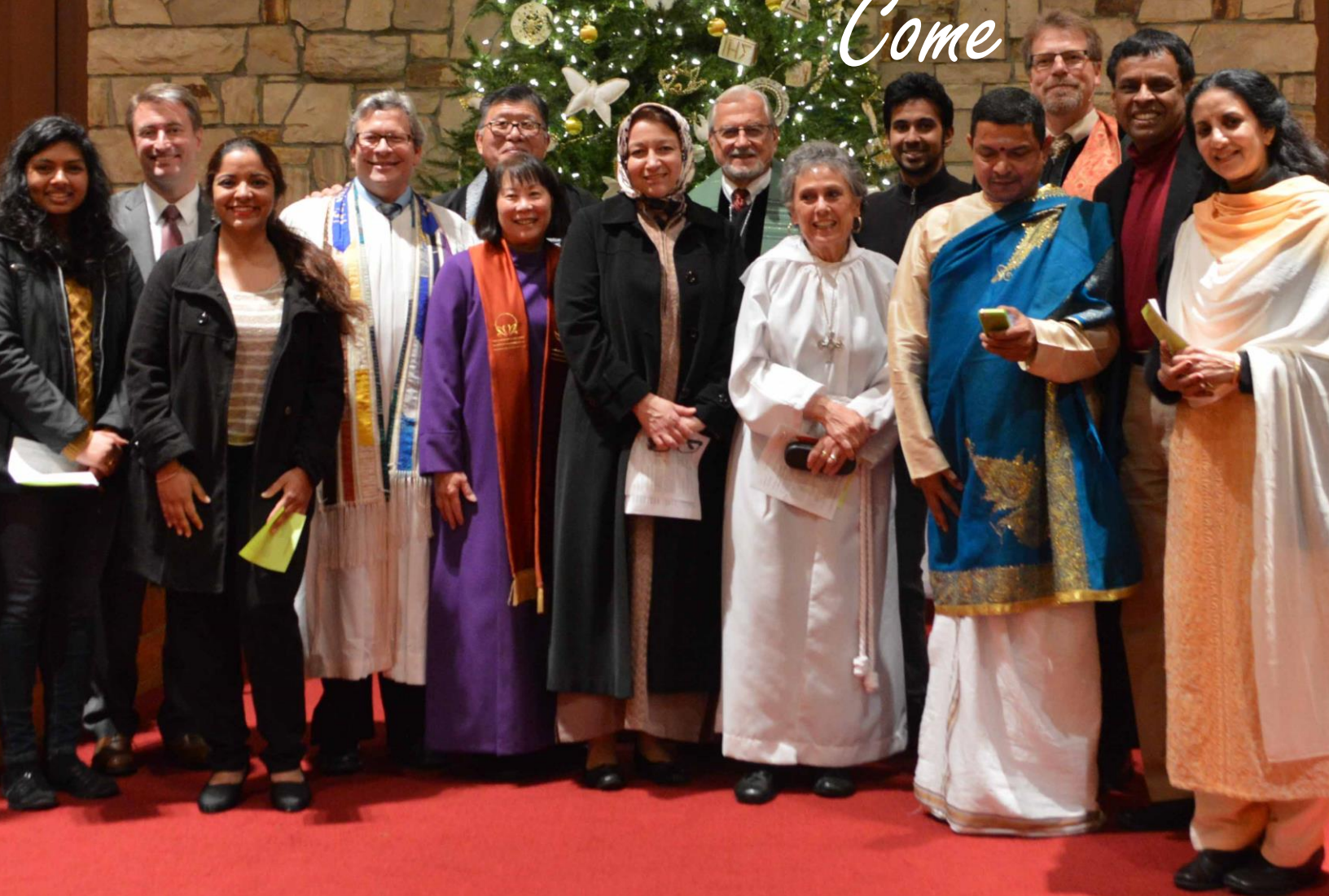
Some of the participants in the Interfaith Thanksgiving Service at the Stone Church of Willow Glen.