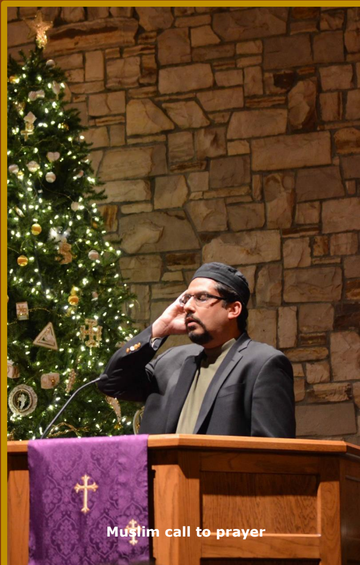
Muslim call to prayer