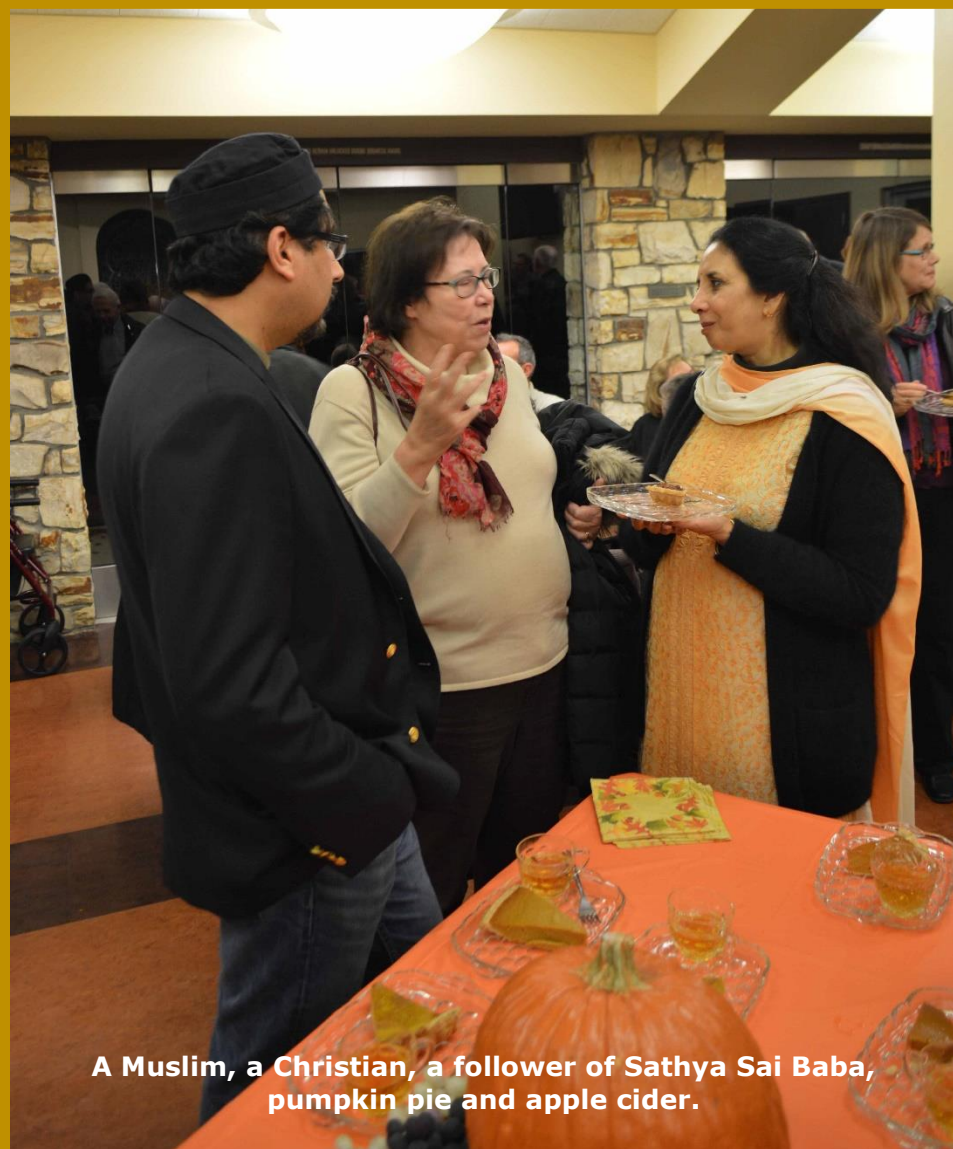
A Muslim, a Christian, a follower of Sathya Sai Baba, pumpkin pie and apple cider.