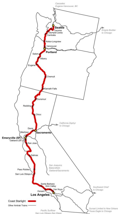
Route of the Coast Starlight

We will fly home Monday night, but unless we get caught carrying too much mouthwash through security, no one will remember that part of the trip.