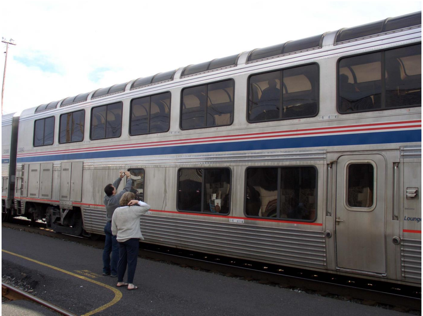
Exterior of the lounge car for sleeping car passengers at Klamath Falls, Ore.