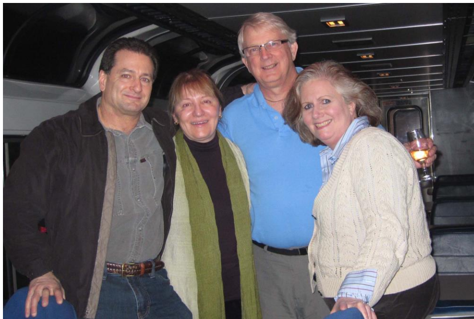
The Coast Starlight provides champagne to all sleeping car passengers. We accepted.